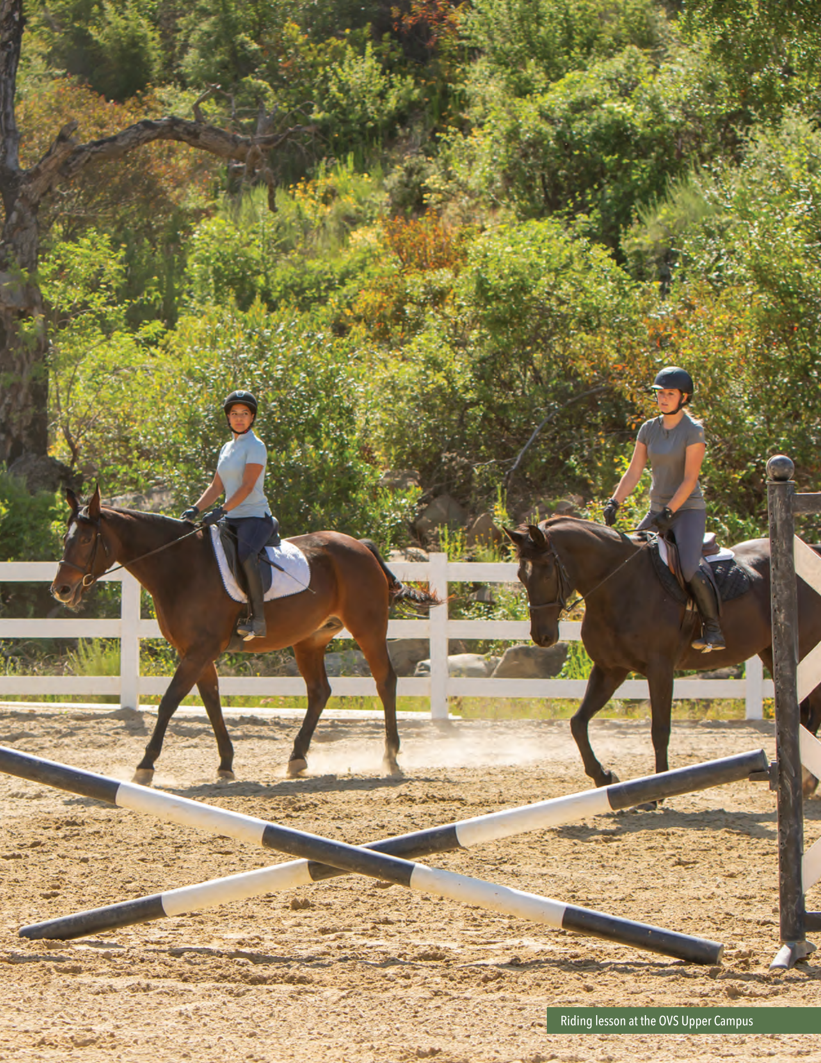
Riding lesson at the OVS Upper Campus