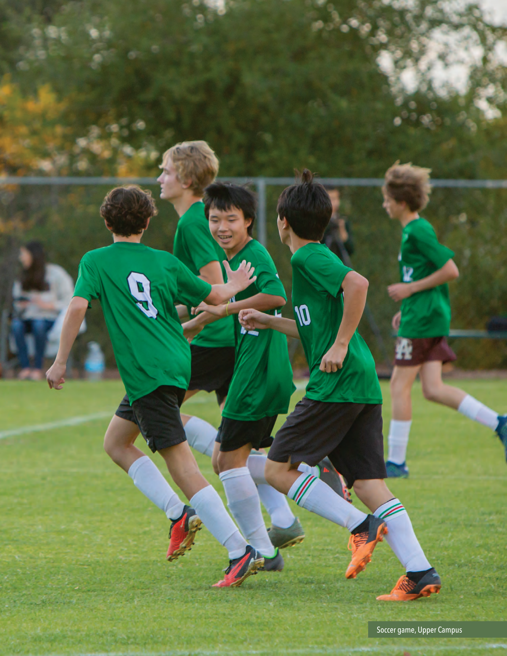
Soccer game, Upper Campus