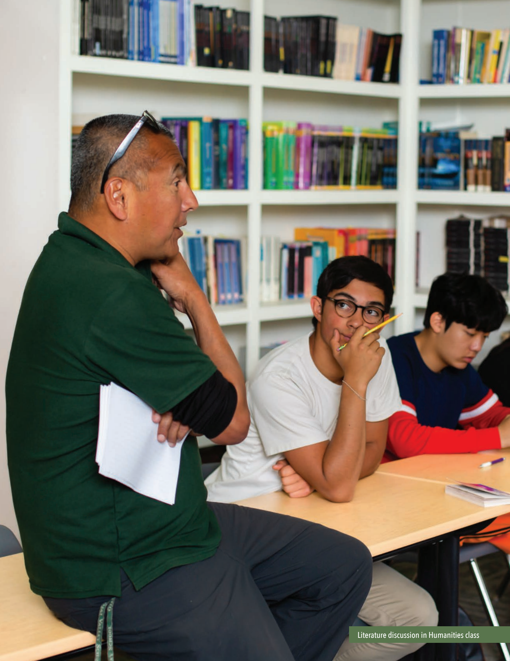
Literature discussion in Humanities class