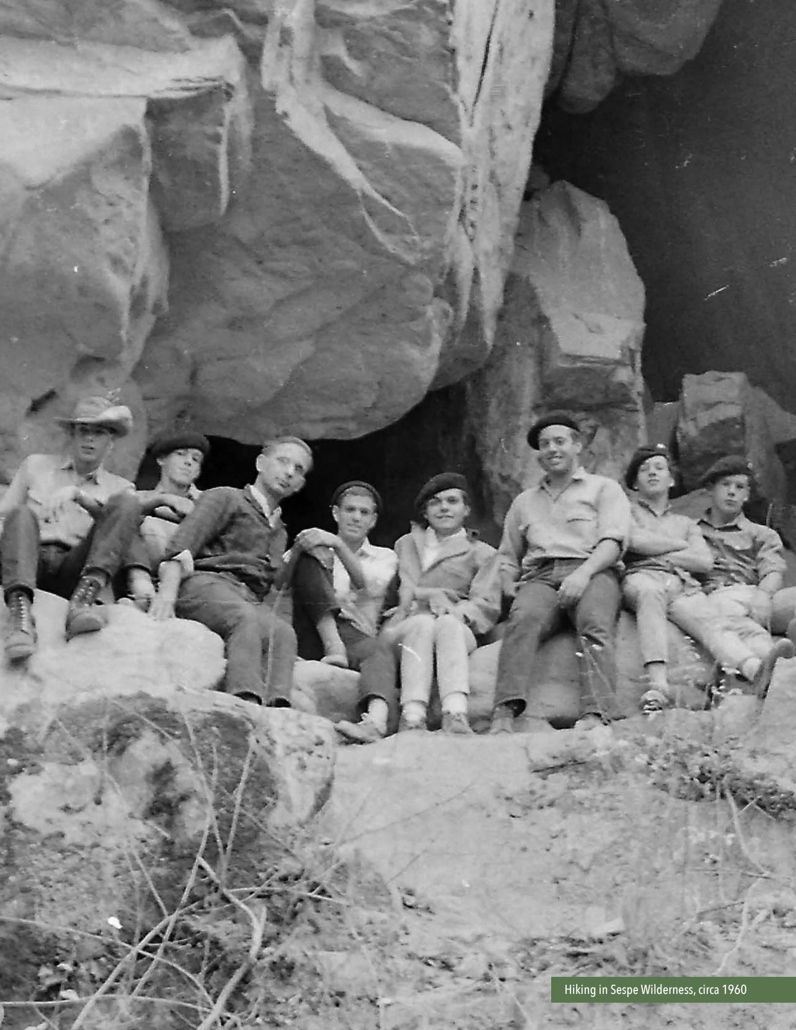
Hiking in Sespe Wilderness, circa 1960