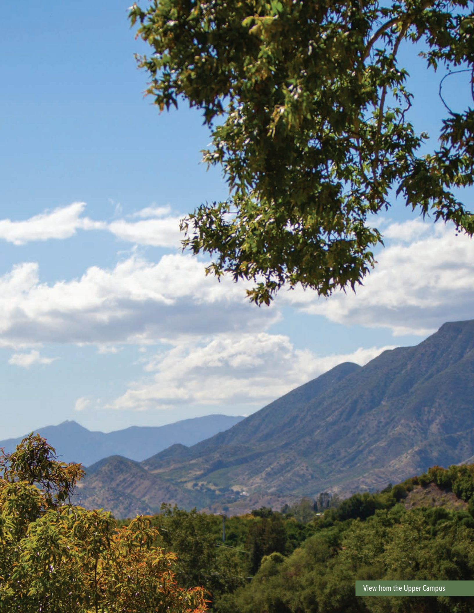
View from the Upper Campus