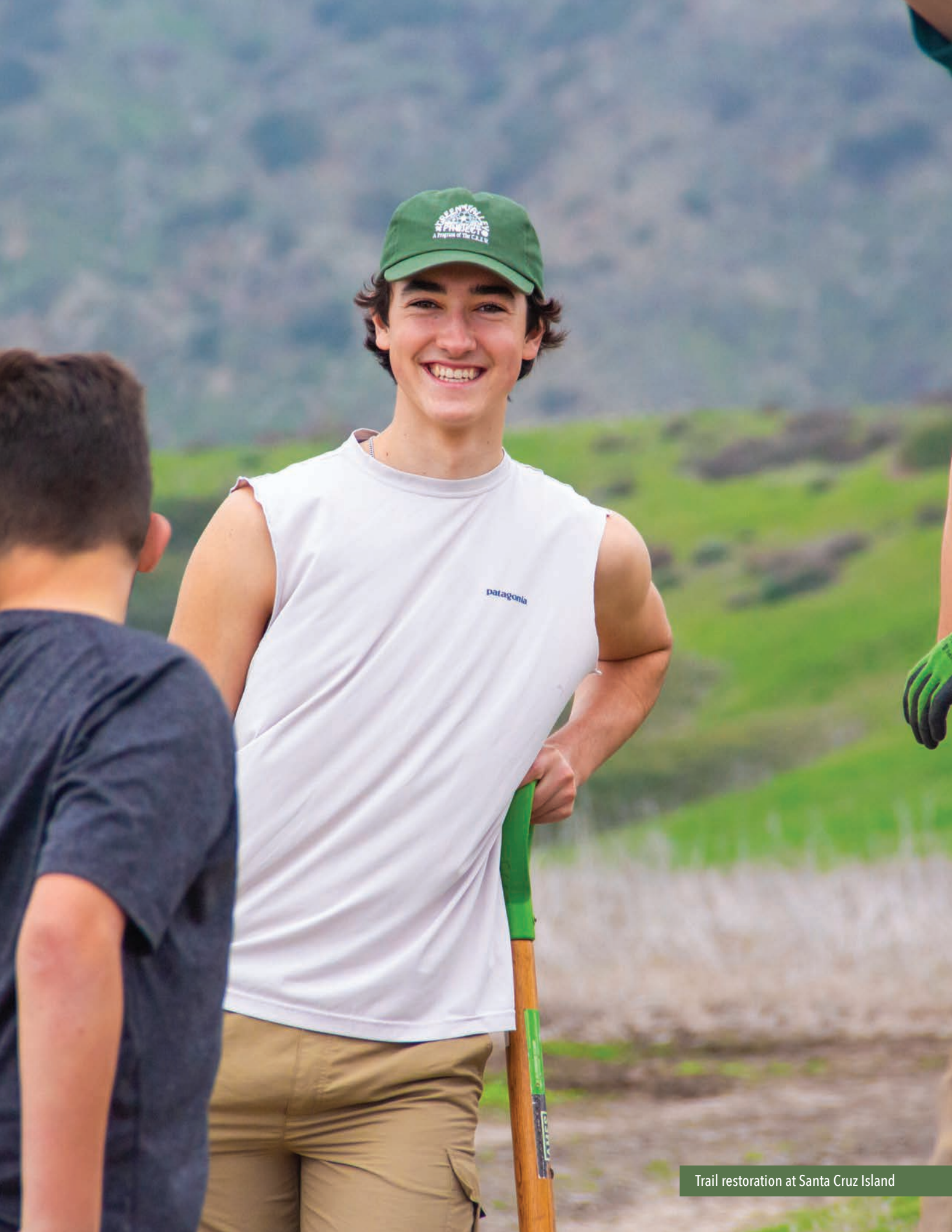
Trail restoration at Santa Cruz Island