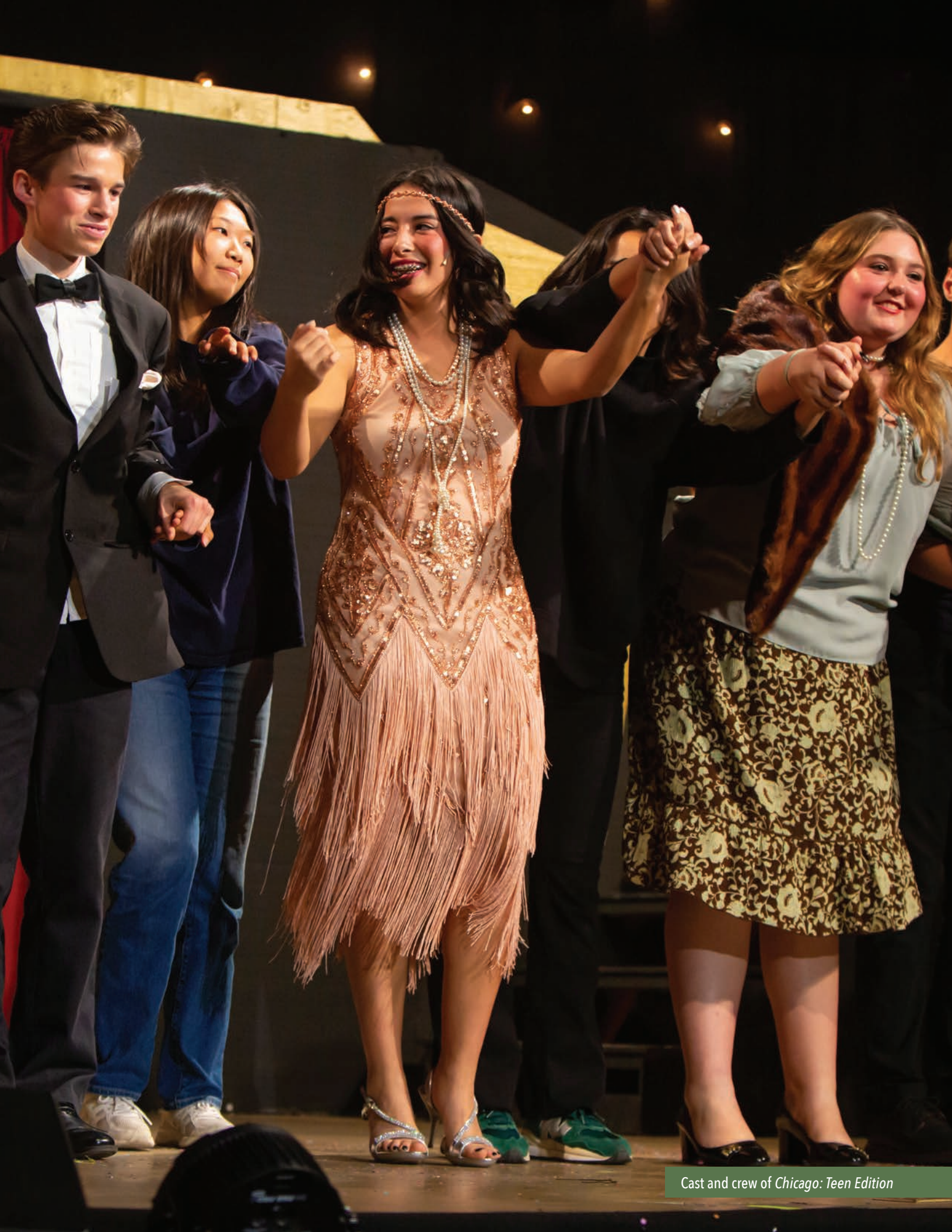
Cast and crew of Chicago: Teen Edition