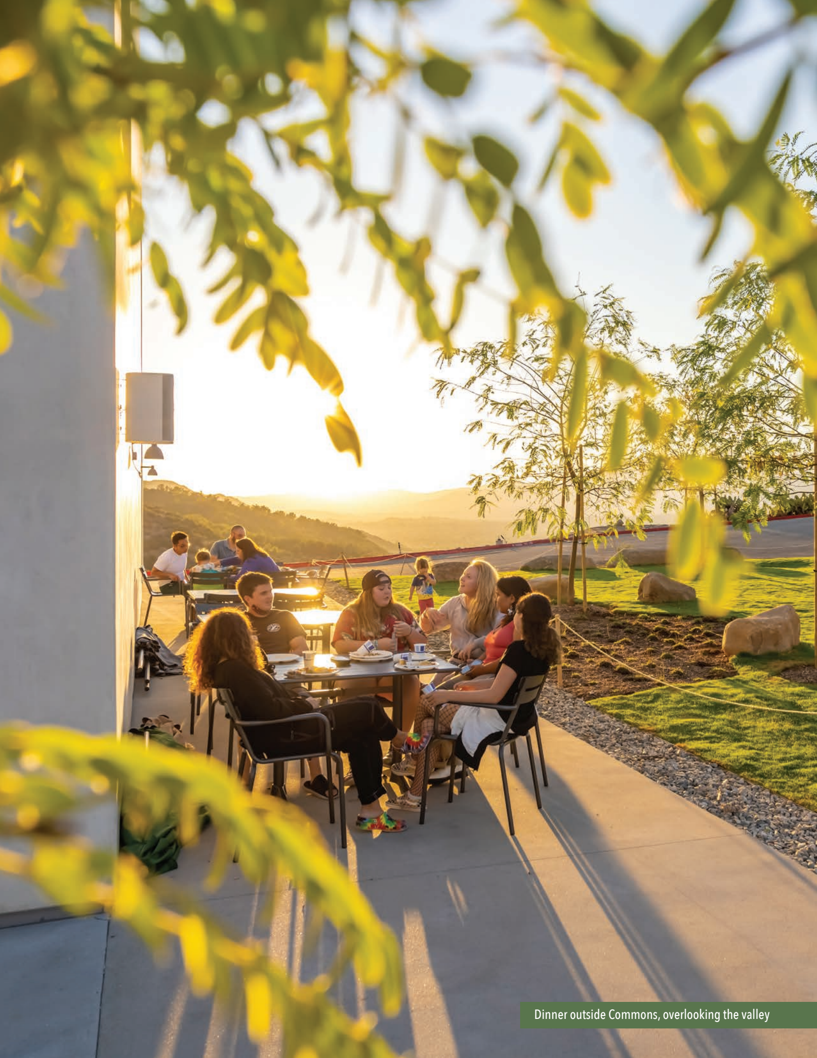
Dinner outside Commons, overlooking the valley