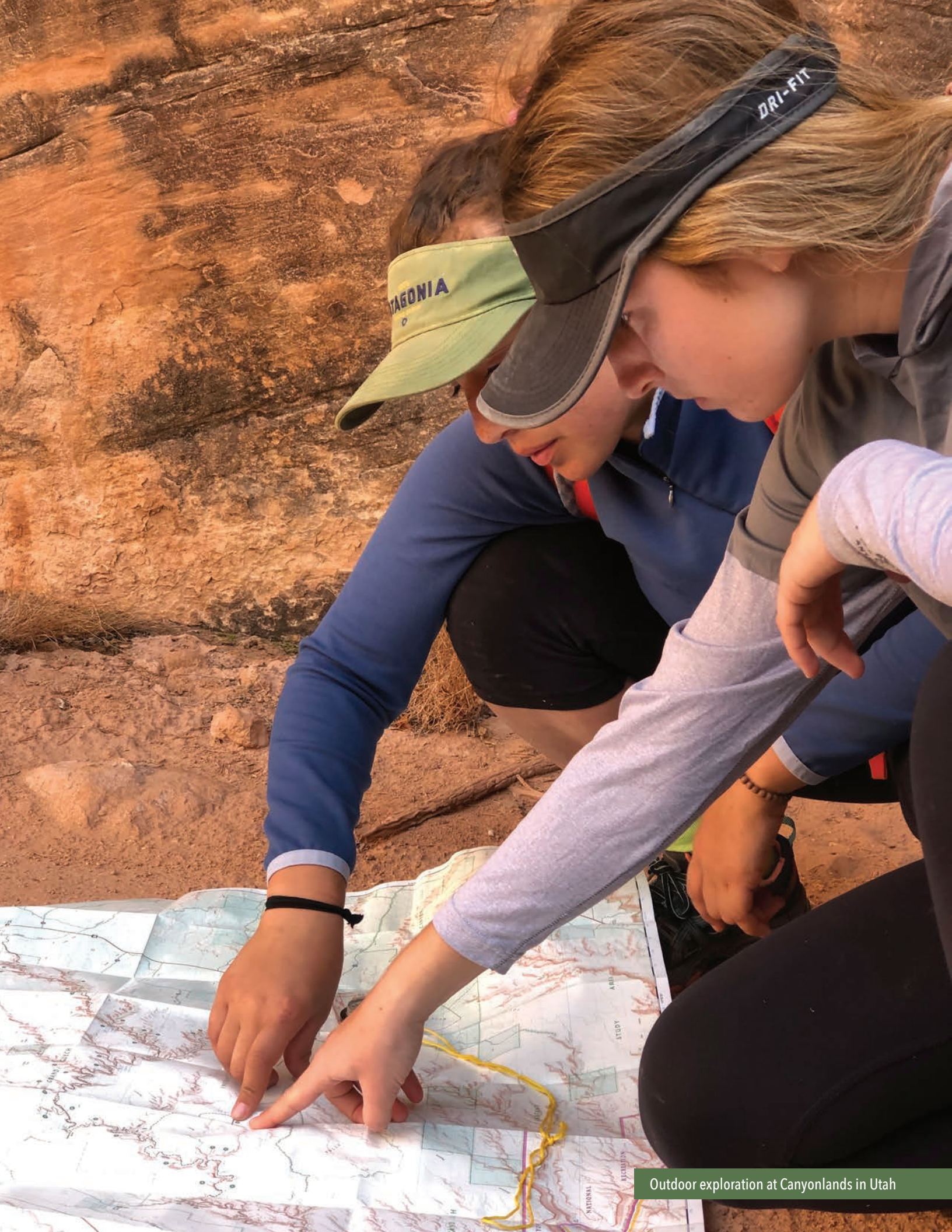
Outdoor exploration at Canyonlands in Utah