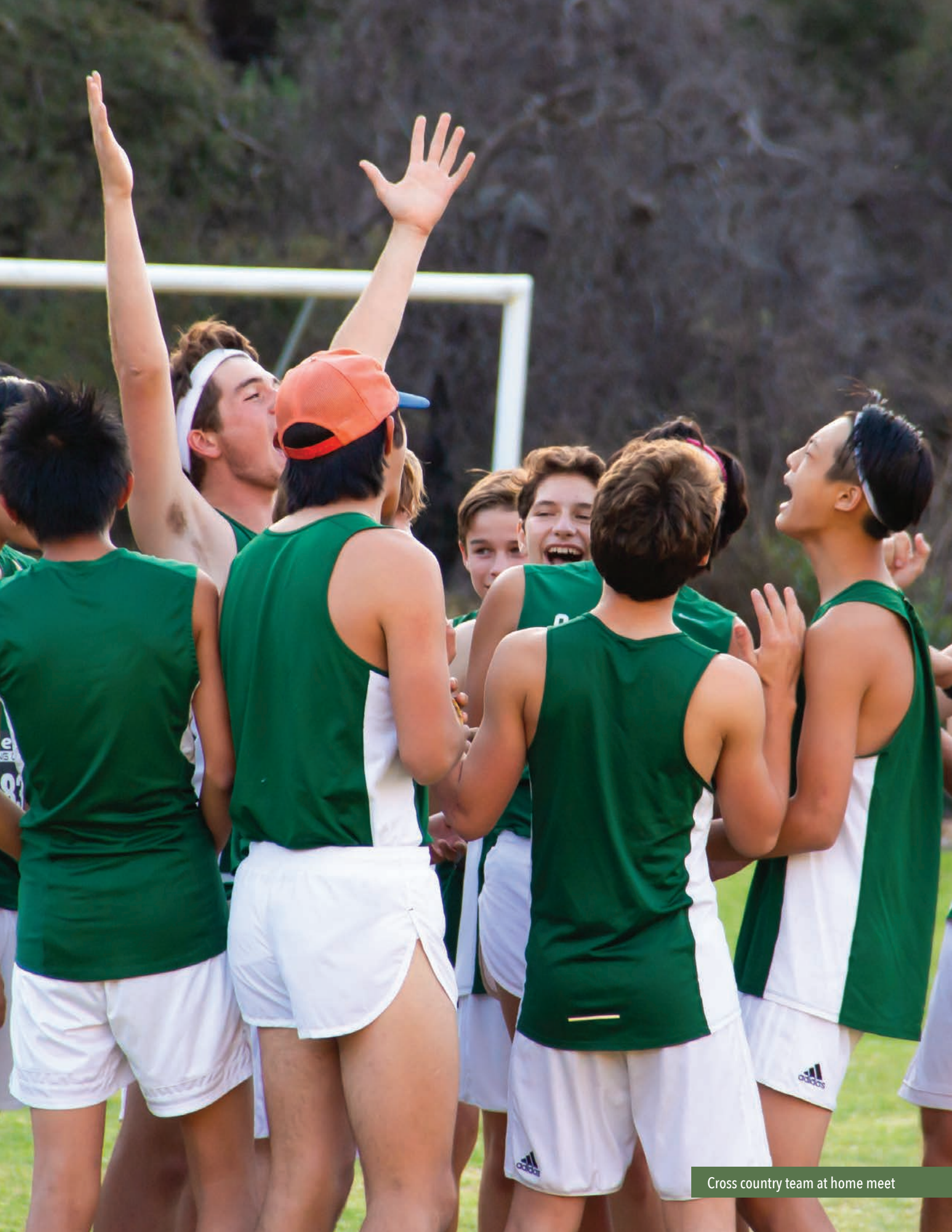
Cross country team at home meet