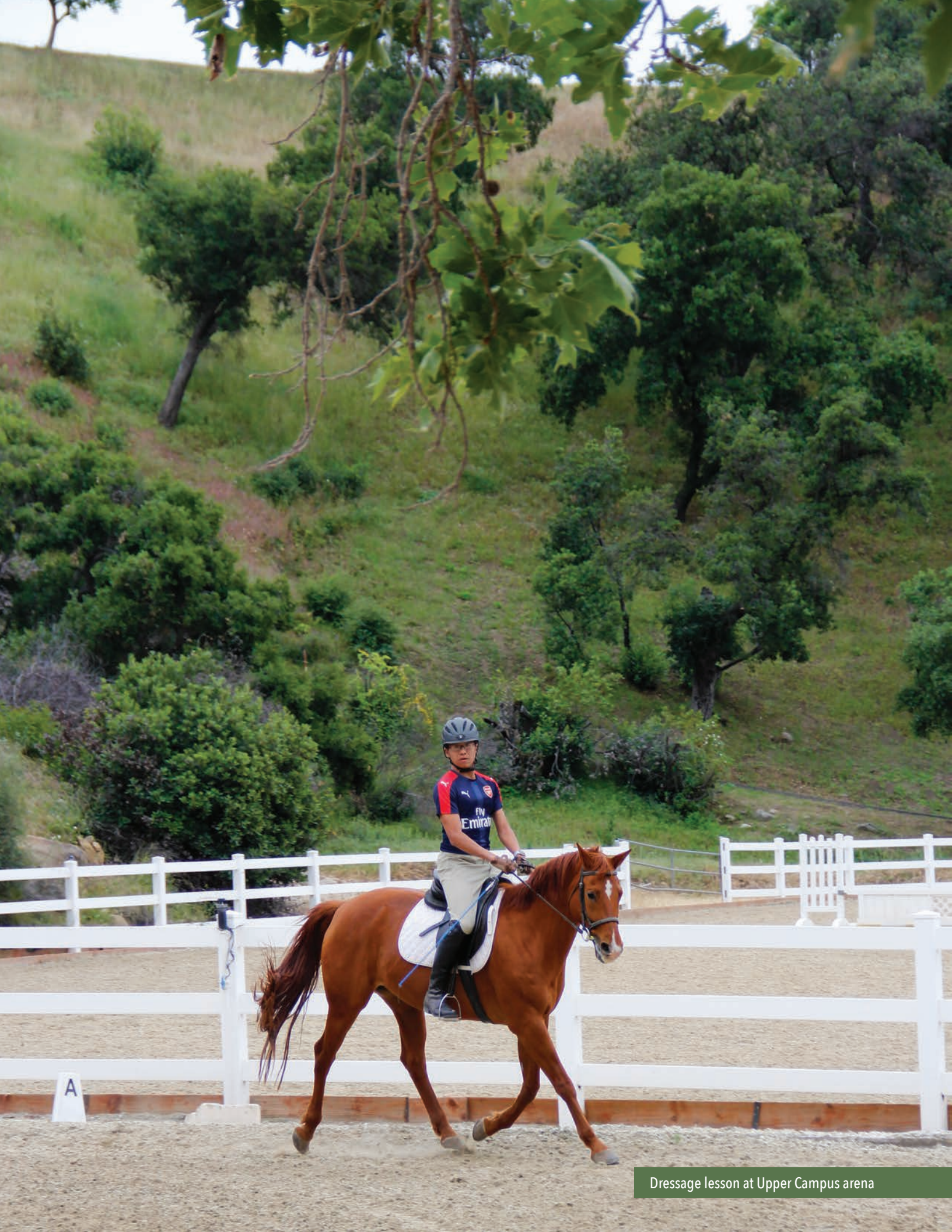
Dressage lesson at Upper Campus arena