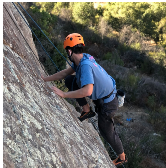
Afternoon climb on the crag.