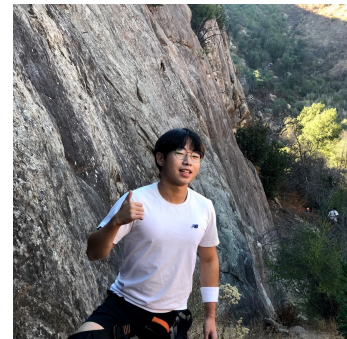
Good day. Down at 5:30 p.m.