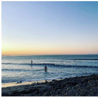
Surf at 5:30 a.m. in Ventura.

Later today, Byars will lead a trip themed "Women in the Water" as nine freshman girls showcase their water skills and learn some new ones on SUPs, kayaks, surf and boogie boards while watching the setting sun at Solimar Beach.