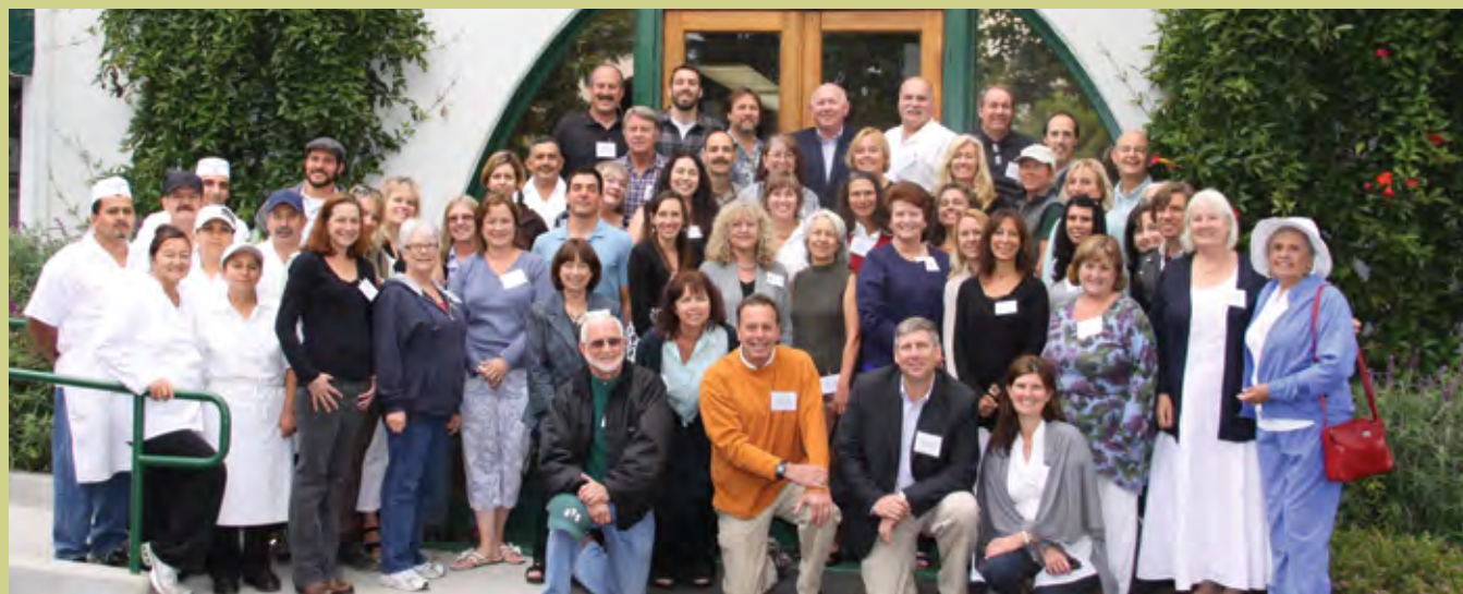
OVS employees, past and present, gather after the luncheon in their honor.