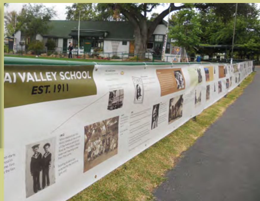
The timeline on the quad