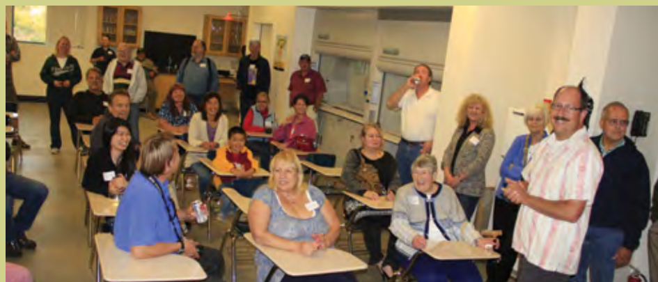
During a tour of the Upper Campus, alums got to feel like students again when they visited the chemistry lab at the Lucila Arango Science and Technology Center.