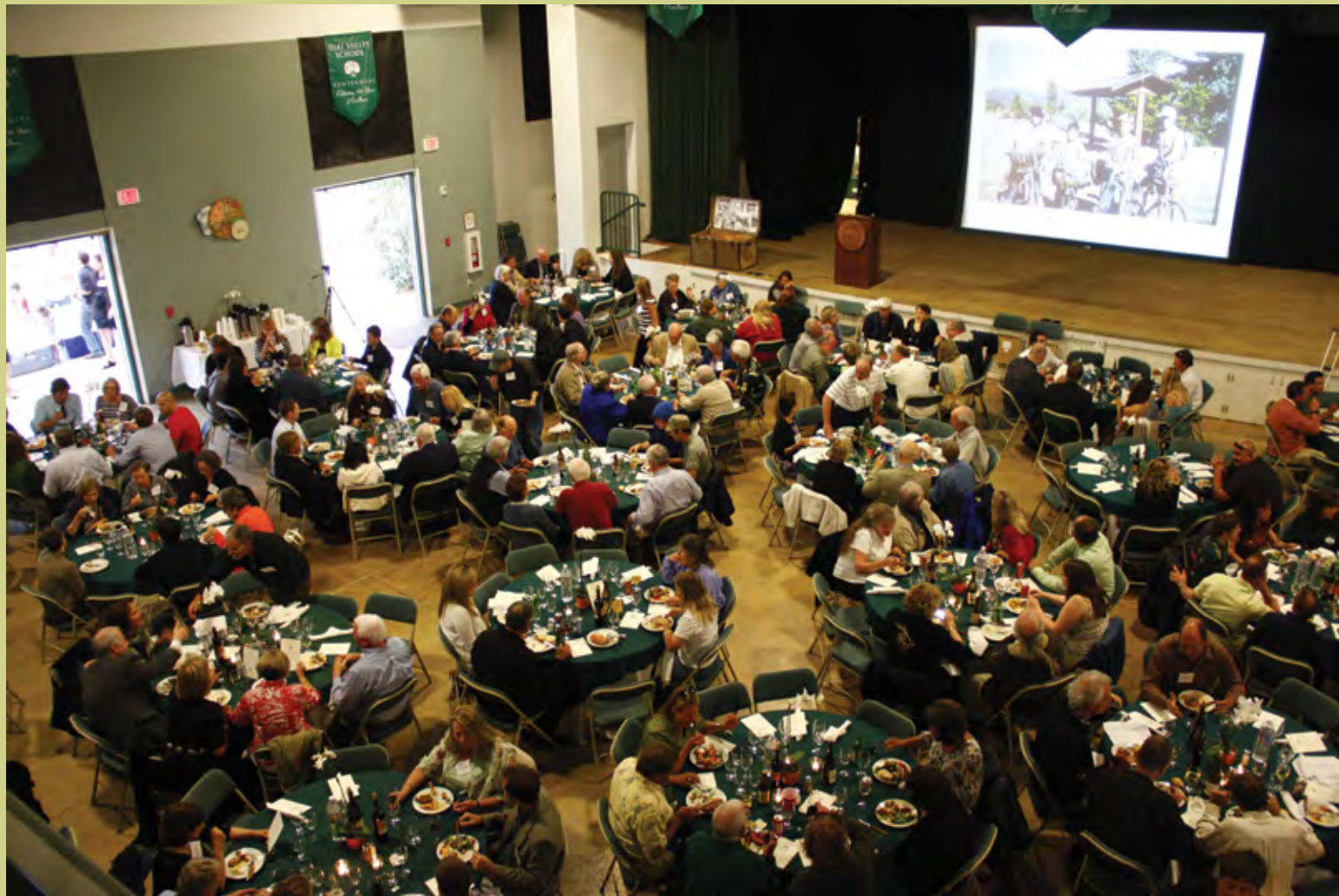
Nearly 300 alumni and guests at the Centennial Celebration Dinner on Saturday night in the Greenberg Activities Center

Thank you for celebrating the OVS centennial with us! For more photos and video, please visit www.ovs.org/centennial