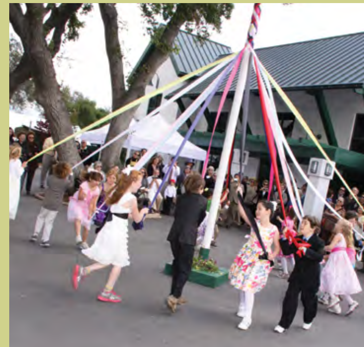
Second-graders perform the traditional maypole dance at High Tea

In honor of the OVS Centennial, the 21st annual High Tea included a maypole dance similar to one performed at Lower Campus in 1936. Children in grades PK-2 entertained more than 200 guests in the Greenberg Activities Center and enjoyed some tasty treats, including giant chocolate-covered strawberries. It was a fun and elegant afternoon, and our students impressed those in attendance with their poise and confidence while dancing on stage, serving tables, and demonstrating their best etiquette as they enjoyed tea treats.