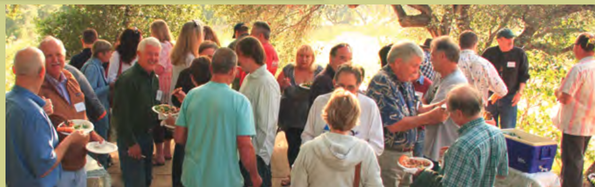
Alumni gathered on Friday evening at the Upper Campus pool complex for a casual meal.