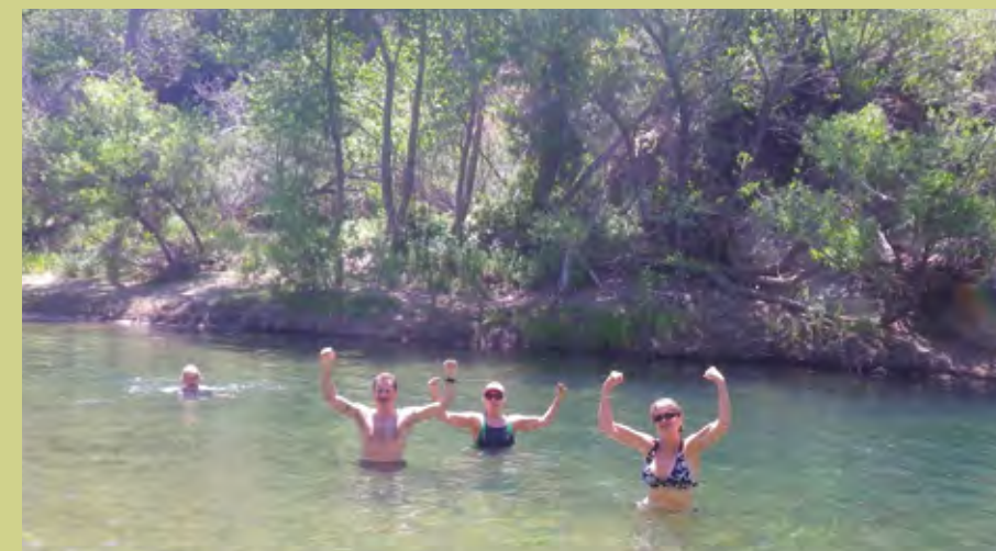
A few hardy alumni and their families enjoying a swim in the Ten Foot Hole