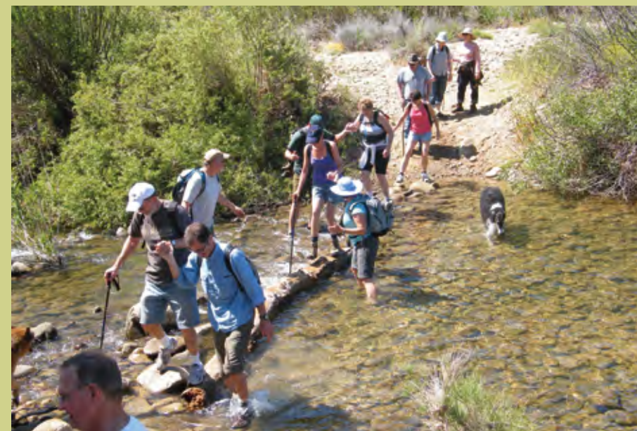
Traversing one of many water crossings up Sespe