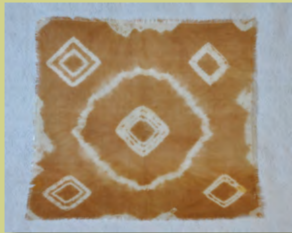
Thank you to Flo (Burbidge) Free (L46) for donating this silk scarf to the OVS archives. In an arts and crafts class at OVS in the late 1930s, she hand-dyed the scarf using walnut husks.