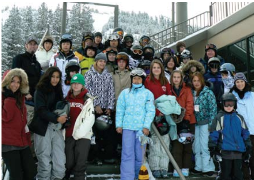
Mammoth Ski Trip