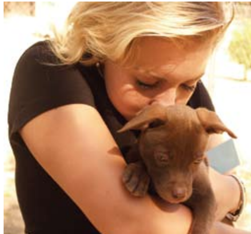
Community Service at the Humane Society