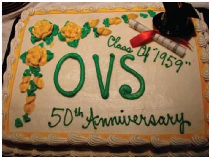
50th reunion cake enjoyed by members of the class of '59.