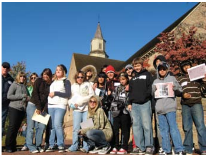
8th grade in Washington D.C.