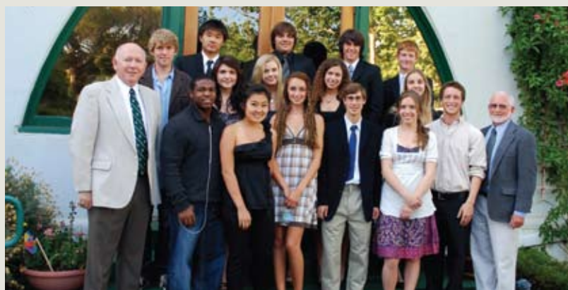
Several high school seniors came back for the Pons Dinner