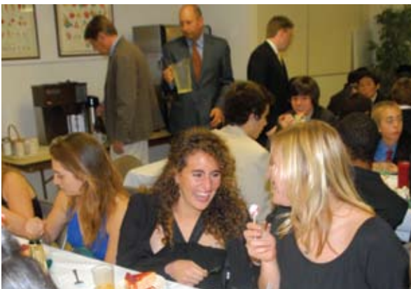
Annual holiday dinner