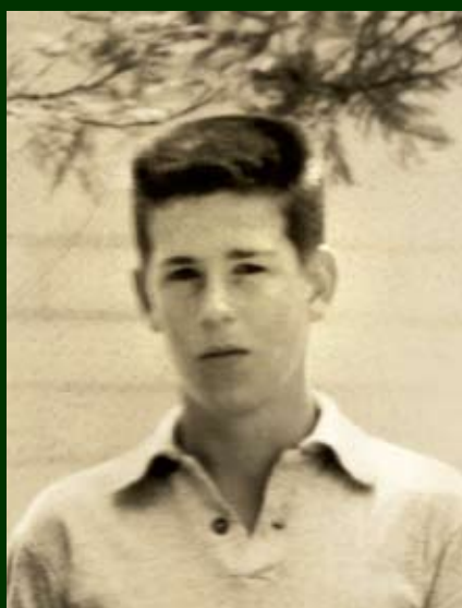
As a ninth grader, Class of 1953