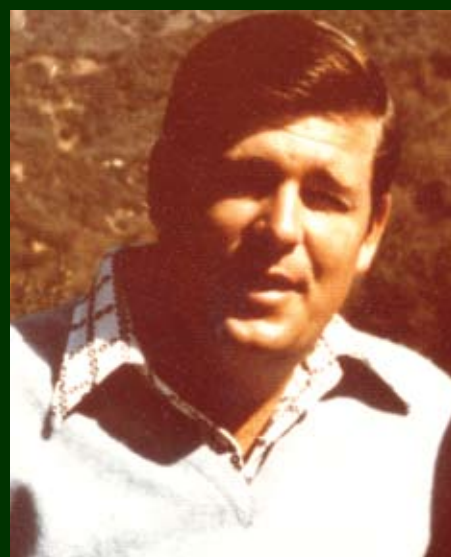
Board of Trustees member 1972-1975