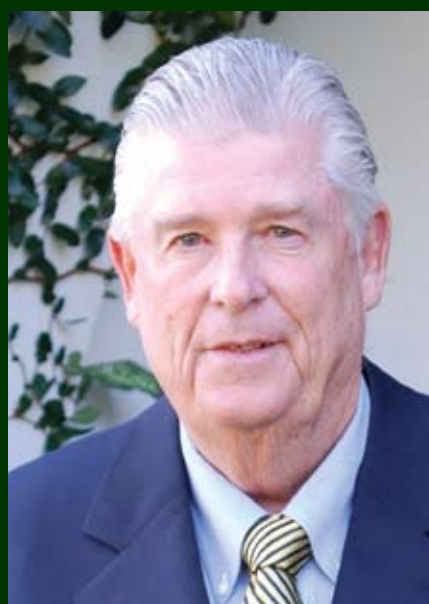
President and CEO, 1975-2009