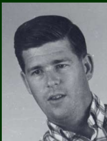
As a dorm father and coach, 1962-67