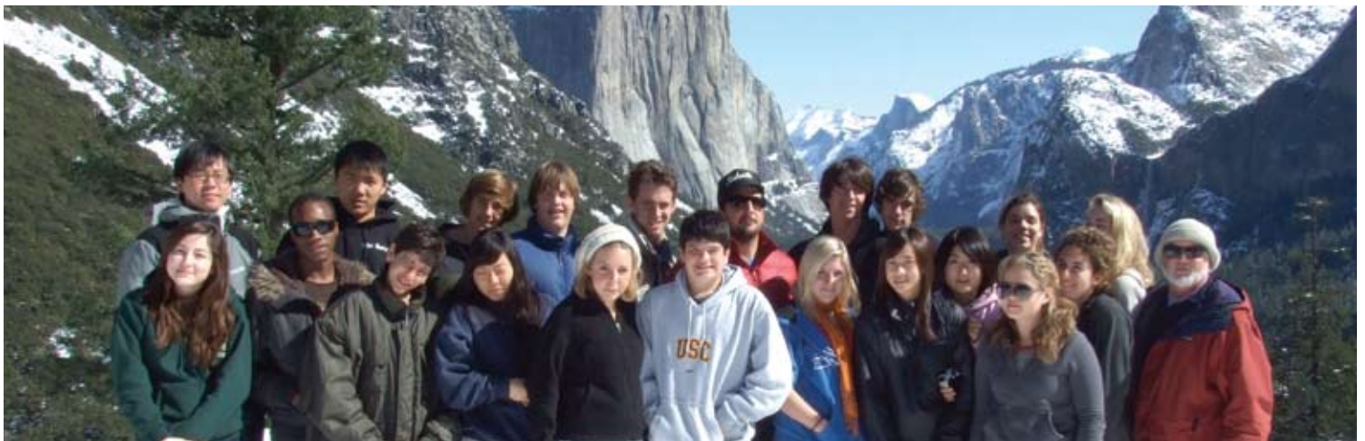
Honors ski trip to Yosemite