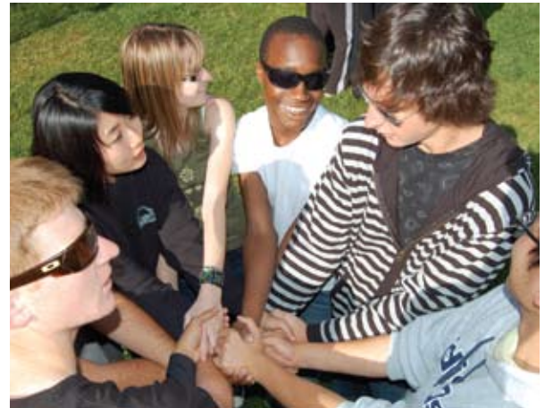
Team Comp Day