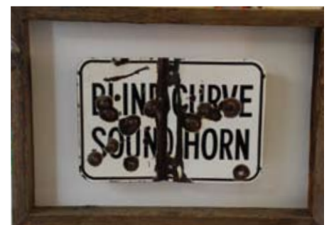
It's a Sign: The stories of the early days of the Upper Campus inevitably involve mention of the harrowing bus rides to the hilltop and back, Mike Hermes often the school bus driver in those days. The road itself hasn't been used since the early seventies. Assistant Lower School Headmaster Gary Gartrell retrieved a sign that had been posted on that road nearly 50 years ago, bent and shot full of holes, but still readable. He had this framed and presented it to Hermes at Alumni Day.

The brunch on Sunday morning was well-attended and gave alums a final opportunity to visit and exchange contact information. All vowed to stay in touch.