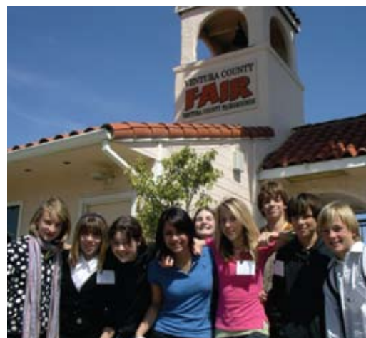
Science Fair finalists at the Ventura County Science Fair