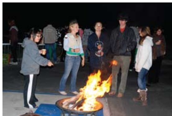
First annual Parent Club S'mores cookout