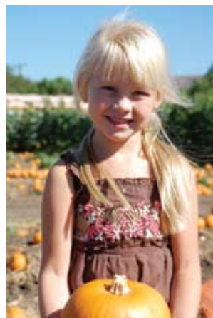
Primary grades visit the Pumpkin Patch