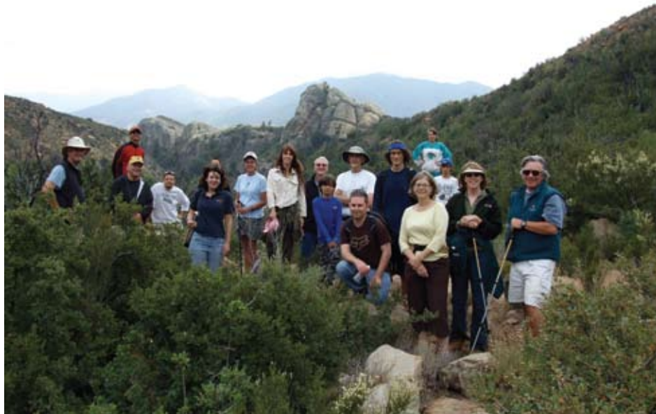
A group of 25 intrepid alums hiked to the White Rocks on Saturday morning. About half the group is pictured here.

The 2009 reunion was fantastic! Next year's gathering will be even better.