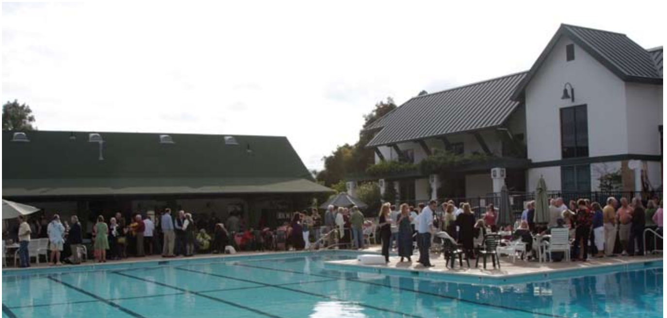
The Lower Campus pool area was the setting for the afternoon cocktail party